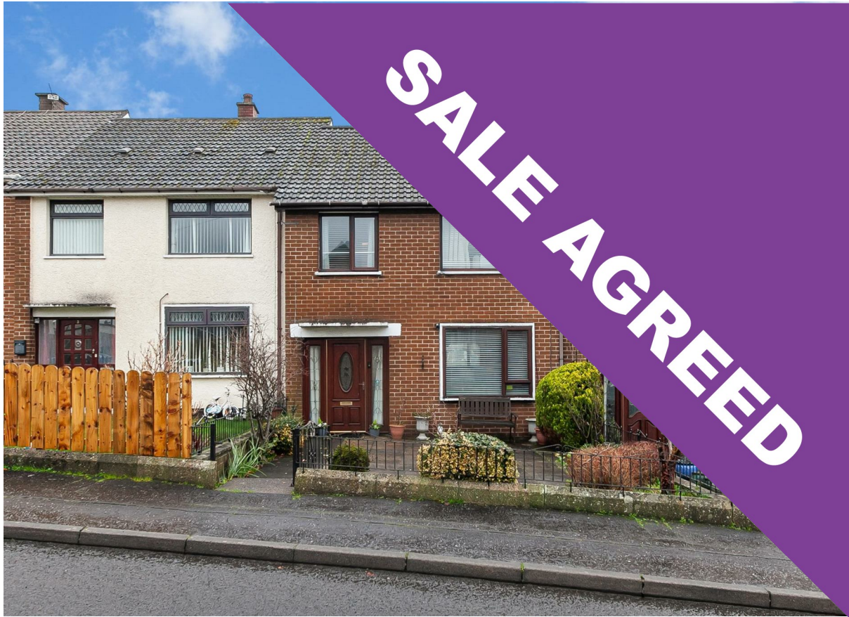
5 Woodland Drive, Newtownabbey, BT37 9QD